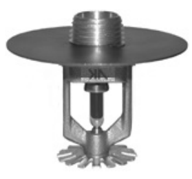
For Optional Sprinkler Guard, Order Guard Separately or Factory Installed (See Ordering Instructions.)

or Stainless Steel Part No. 14684. Order Water Shield and Pendent Sprinkler Separately (Field Assembly Required)