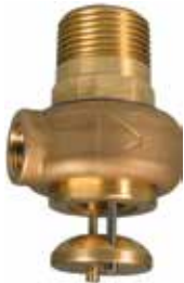
Series 953 Emitter